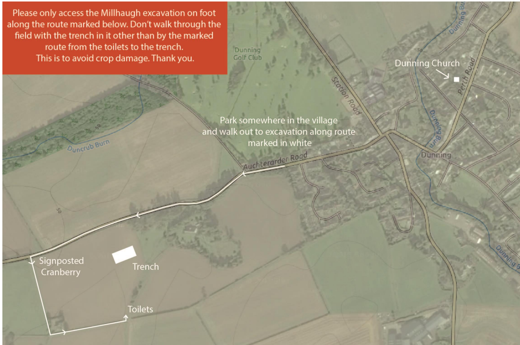
Figure 2: Map of access route from B8062 to the trench (follow white arrows)

Please only access the Millhaugh excavation on foot along the route marked below. Don't walk through the field with the trench in it other than by the marked route from the toilets to the trench. This is to avoid crop damage. Thank you.